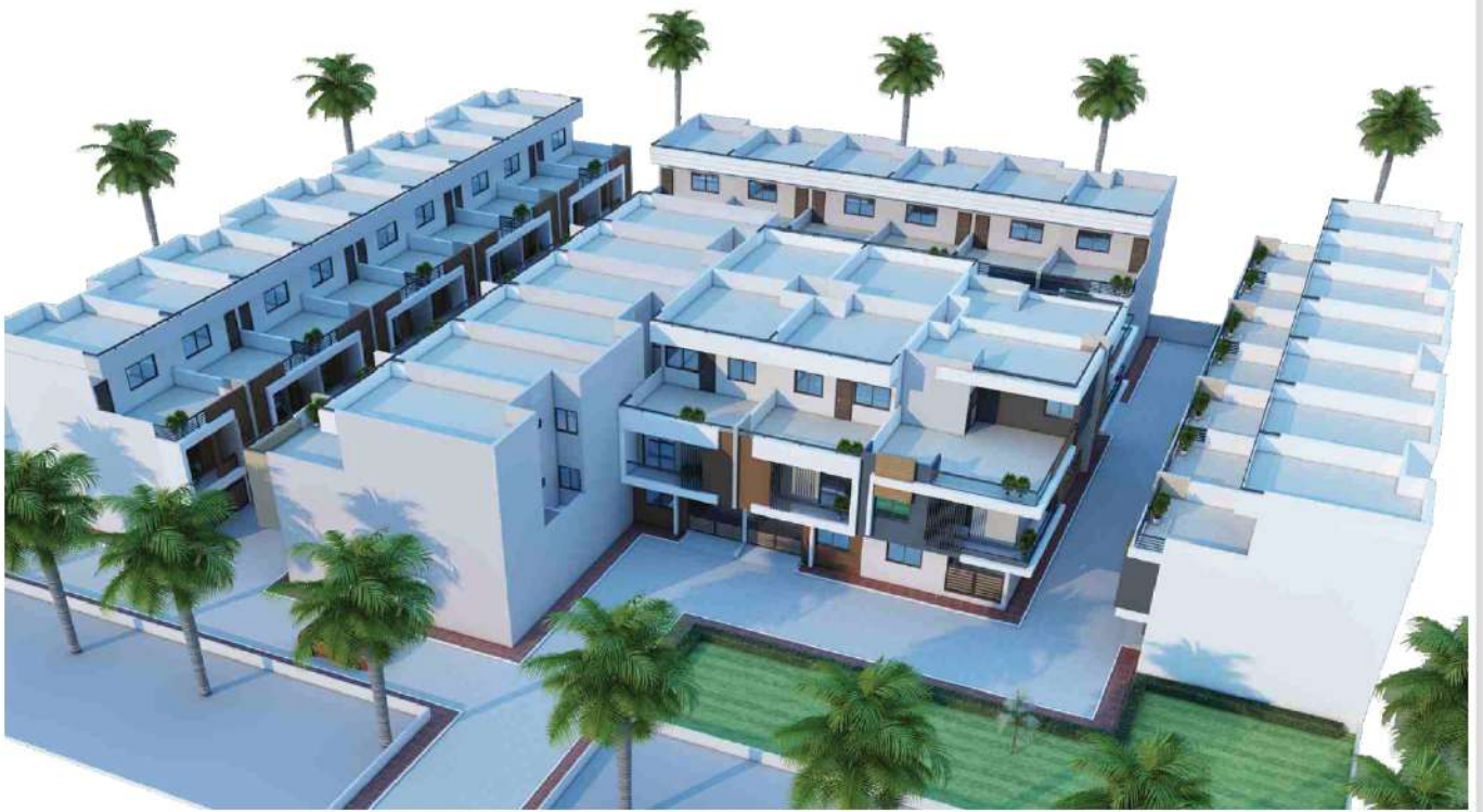
Image is purely conceptual & artistic impression only. It constitutes no legal offering.